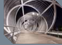
ARCHITECTURAL & CONSTRUCTION