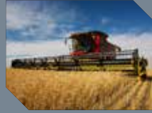
AGRICULTURE & FARM