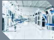
HEALTH & FITNESS