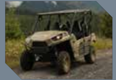
LAWN & GARDEN EQUIPMENT